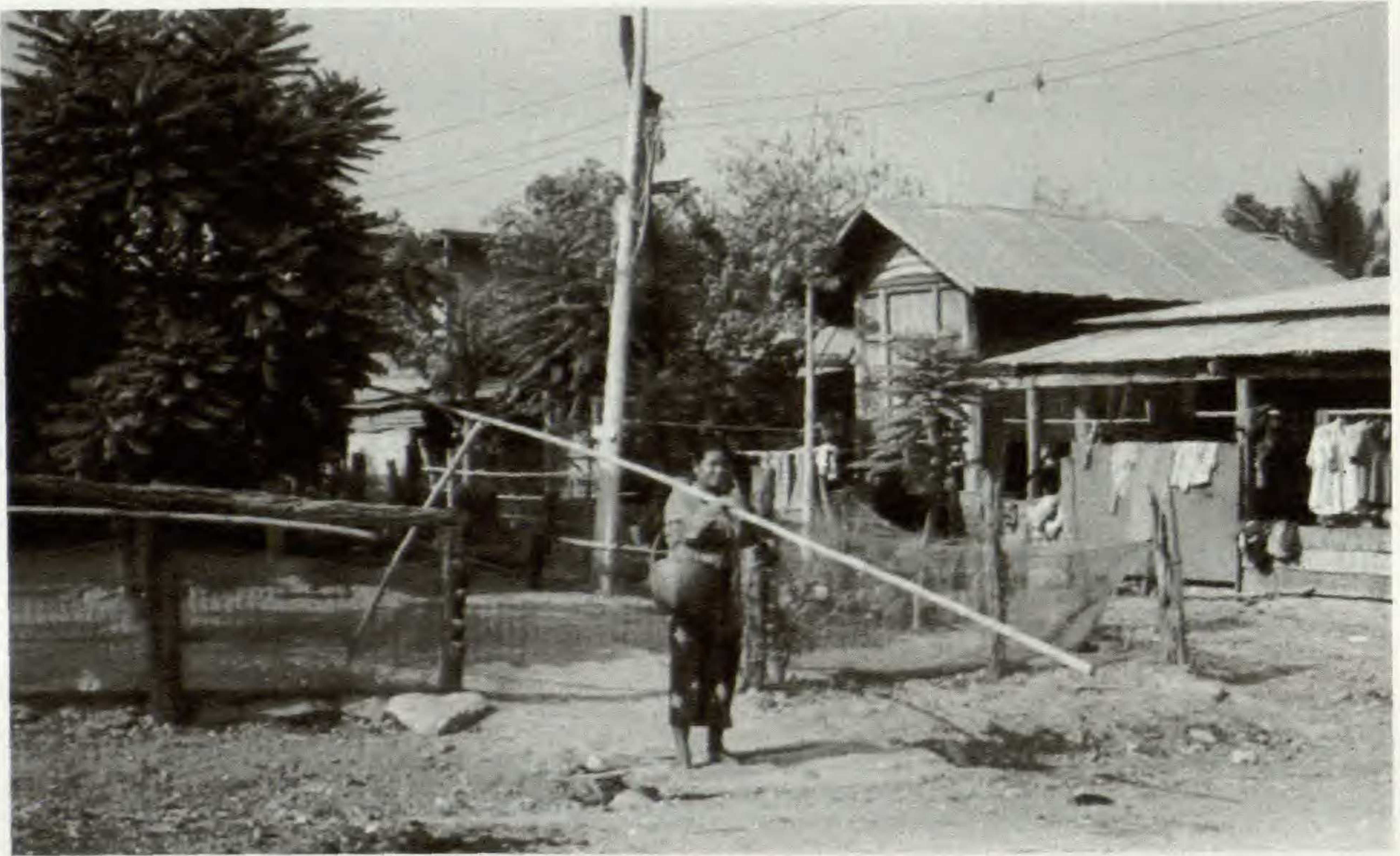
FIGURE 4.—A village woman on her way to gather red ants.

are being used as cash generators. At the same time the abundance of these resources is declining due to national economic and forestry programs that do not emphasize the local species. The local economy has expanded to emphasize cash cropping, wage earning and both temporary and permanent out-migration of adults.